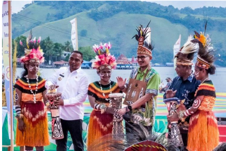
Figure 5. Minister of Tourism and Creative Economy Sandiaga Salahuddin Uno (green dress) when opening the event "Lake Sentani Festival XIII 2023" which takes place on the shores of Lake Sentani, Jayapura Regency, Papua, Wednesday 5 July 2023

At the Sentani Lake Festival event, the diversity of local communities is reflected through art, dance and music performances representing the various tribes that live around Sentani lake, such as the Sentani, Dani, Yali and other tribes. This artistic performance depicts harmony and diversity between various ethnic groups, highlighting the importance of tolerance, respect and appreciation for cultural differences. The art displayed at this festival is a reflection of the rich local culture that has been passed down from generation to generation. Through traditional dances, theatrical performances, painting and typical handicrafts, this festival is a means of preserving and promoting local wisdom and the unique cultural identity of the people around Sentani Lake. The Sentani Lake Festival also provides an opportunity for local communities to showcase their creative economy products. Through handicraft exhibitions, art markets and other local economic performances, this festival not only promotes cultural values, but also contributes to the economic empowerment of communities around the lake. This includes promoting local products, increasing tourism and opening up new business opportunities for local residents.