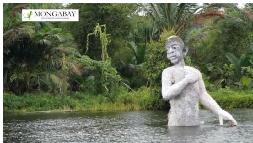
Figure 9. Statue Installation in the Middle of Jaifuri River