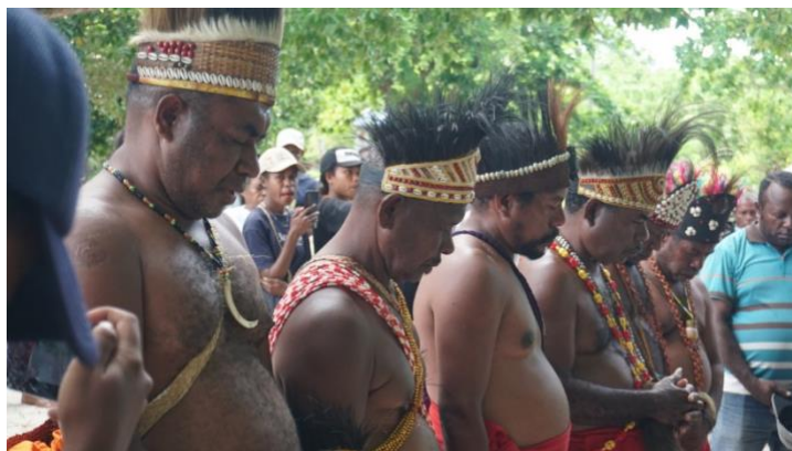
Figure 10. Six keret (clan) heads from the Biak Karon indigenous community pray for Sasisen tradition on Pulau Dua, Bikar District, Tambrau Regency, Southwest Papua.