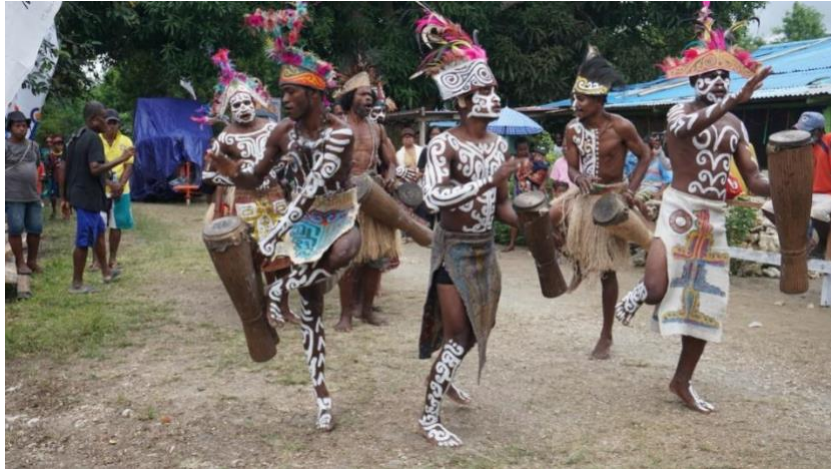
Figure 3. A number of young people danced the Wor dance to mark the start Munara Beba Byak Karon Festival in Werur Village, Bikar District, Tamberauw Regency, Southwest Papua

Over time, visual art also reflects environmental changes and the influence of social change in Papuan society. In more contemporary works of art, the influence of climate change, the decline of natural resources, and environmental issues are reflected in the themes and elements used. Artistic representations are a reflection of environmental changes and their impact on Papuan people. As was done by the Biak Karon community who held a festival entitled "Munara Beba Byak Karon Festival " in Werur Village, Bikar District, Tamberauw Regency, Southwest Papua on Wednesday, March 22 2023. Quoted from Kompas.id Biak Karon community dancing and singing all day long to celebrate a big party of togetherness, from young to old mingling in one goal, namely protecting their culture and sea [10] accessed 13 October 2023.