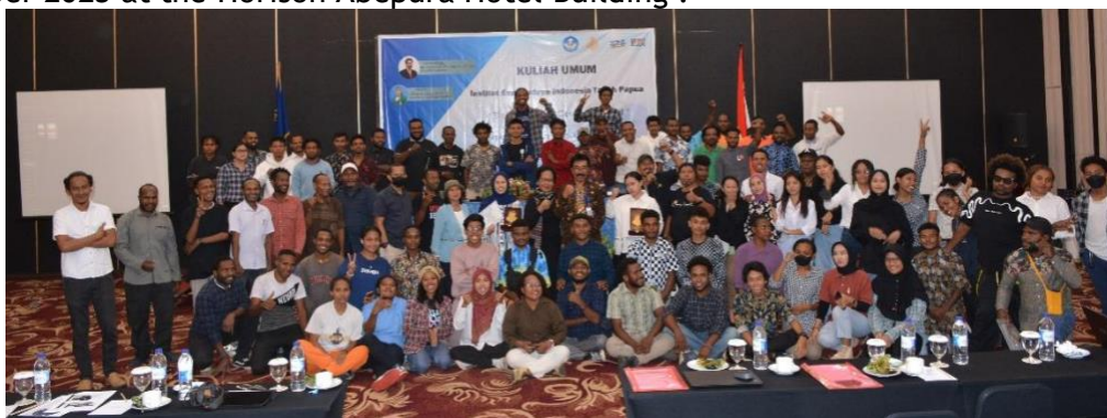
Figure 6. The Chancellor of ISBI Tanah Papua together with resource persons and the entire academic community consisting of educational staff and students in a group photo session at the Public Lecture activity entitled "Art Ecology in Creating Creative Spaces" 2023

The analysis then refers to activities that express more experimental and modern art, creating a fresh perspective on the relationship between art and the natural environment and Papuan culture. This activity is made possible by the existence of institutions that encourage efforts to understand further the values of local Papuan cultural wisdom through artistic creativity, such as public lectures, seminars and cultural performances to welcome certain moments related to art. One of them was carried out by the academic community of the Indonesian Arts and Culture Institute of Papua Land through a public lecture entitled “Ekologi Seni dalam Cipta Ruang Kreatif” (Art Ecology in Creating Creative Spaces) on Wednesday 13 September 2023 at the Horison Abepura Hotel Building .