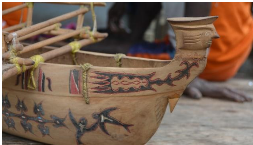
Figure 1. Lobster Decoration Motifs on Sobey Tribe Fishing Boats

Visual art in Papua is a form of deep expression of the relationship between humans and the natural environment and culture of the Papuan people. Representation in this visual art reflects several very important aspects. Sentani lake and the Papua Sea are sources of artistic inspiration, where the forms of art that emerge represent how strong the spiritual and cultural connection is between the Papuan people and these two natural elements. Local symbols and motifs are used in works of art as a means of communicating cultural beliefs and values that have been passed down through generations. This creates a deep connection between art and local culture, and visual art becomes a form of respect for nature and their cultural heritage. One of them is a representation of the Sobey tribe's decorative boat motif.