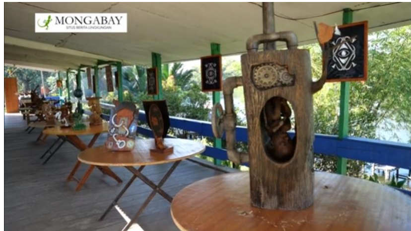
Figure 8. Abstract art works displayed in the art entitled Romiyea Phuklah [Source: Reference [15] accessed 13 October 2023]