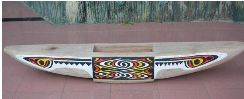
Figure 12. Kelambut Patterned Musical Instrument [Source: Reference [17, p. 51]]

Papuan people. For example, the motifs found in the typical musical instrument of the Sentani region, namely Kelambut .