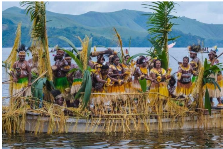
Figure 4. Documentation of the Isosolo Dance in the Opening "XIII Lake Sentani Festival 2023"

In its 13th implementation in 2023, the Lake Sentani Festival will take place for three days from 5 to 7 July 2023, opening with the Isosolo Dance performed by around 250 dancers from 10 villages consisting of two East Sentani Districts and eight Sentani Districts, Jayapura Regency. . Different from other regional dances, the Isosolo Dance is performed on a decorated boat. This dance is usually carried out on the orders, blessing or instructions of Ondoafi or the original Sentani traditional leader [12] accessed 13 October 2023.