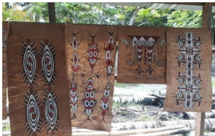
Figure 13. Yonikhi Motif On Papuan Batik Cloth [Source: Reference [17, p. 54]]

The Sentani tribe has distinctive ornaments and is their identity they. This ornament is called yonikhi . Yonikhi consists of the words 'yo' which means village, and ' nikhi ' which means traditional rules [17]. The presence of yonikhi ornaments on the Kelambut means that they pray to God Almighty for success in their work and also ask their ancestors to always receive protection, especially when facing danger. Apart from that, the yonikhi symbol also serves as an indirect warning so that residents always obey existing customary rules even though the rules are not written. These traditional rules are transmitted orally from one generation to another through certain myths or folk tales