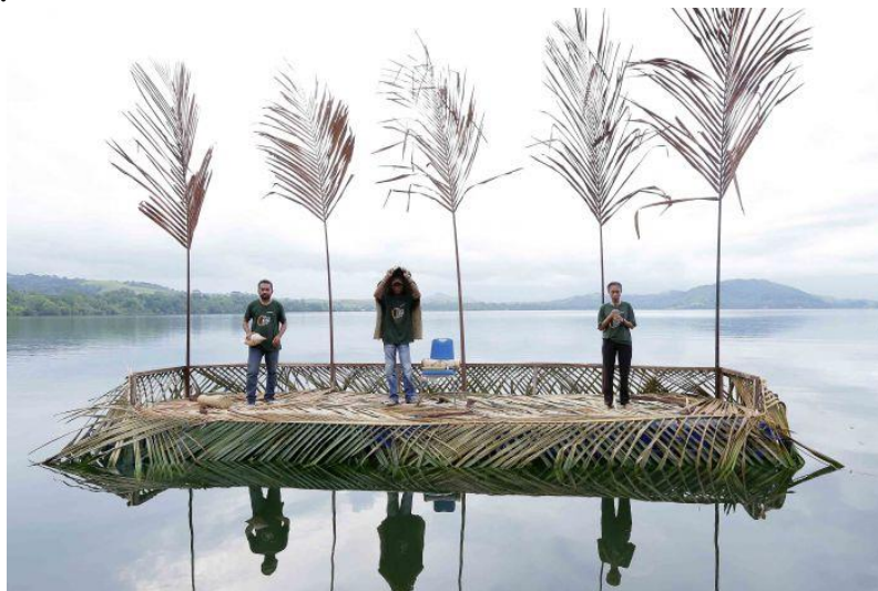
Figure 7. Young musicians perform musical collaborations at Lake Sentani, Jayapura, Papua

At different times and places, as many as 14 young musicians participated in the Music Arts Gathering in Papua, including 4 young Papuan musicians who performed so well, stunningly and compactly, presenting contemporary musical compositions performed in the midst of the community and the beautiful natural panorama of Puai village on the edge. Lake Sentani, Jayapura, Papua.