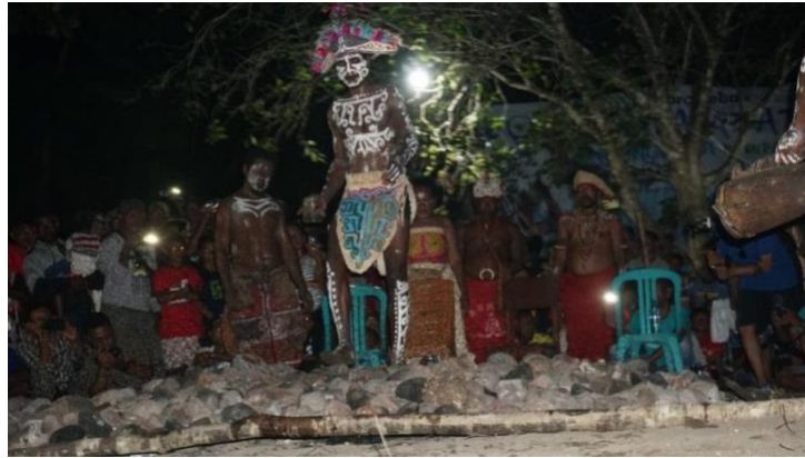
Figure 11. Traditional figures from the Biak Karon indigenous community walk on coals in the Apen Bayeren attraction in Werur Village in a series Munara Beba Byak Karon Festival

between humans and the Creator or the relationship between humans and nature [10] accessed 13 October 2023. As explained further, there is also another typical Biak dance which is rarely performed, namely Apen Bayeren . Apen means burnt stone, while ' bayeren ' means agreement. This dance is performed to unite the differences in frequency between humans and coal. When everything is no longer different, the coals you step on will no longer feel hot. In this attraction, a number of traditional figures will recite neno-neno which means praise. This dance has a philosophy as an offering from humans to God.